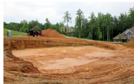
Lot 52 Windjammer Ln