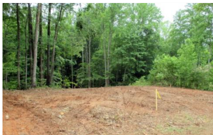
Lot 23 Crows Nest Dr