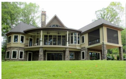
Lot 13 Yardarm Ct