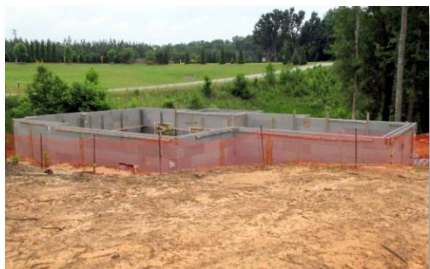
Lot 89 Keel Ct