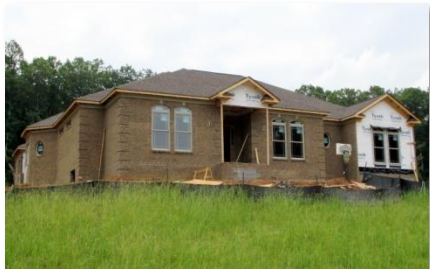
Lot 4 Yardarm Ct

There are currently nine houses under various stages of construction in our development (ranging from recent tree clearing to essentially complete). Photos of the lots (taken on June 4, 2013) are shown below.