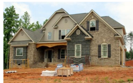
Lot 101 Keel Ct