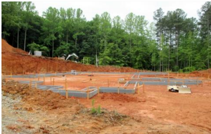
Lot 11 Yardarm Ct