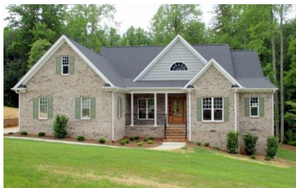
Lot 92 Keel Ct