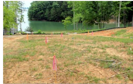
Lot 12 Yardarm Ct