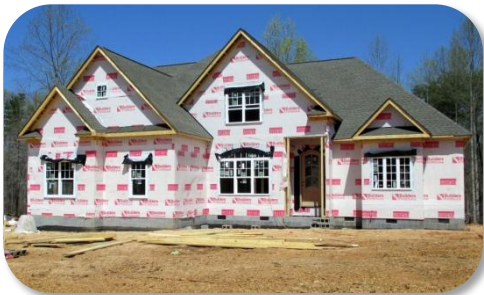
Lot 117 Topside Ct