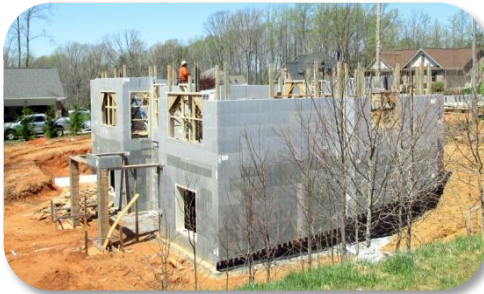
Lot 89 Keel Ct