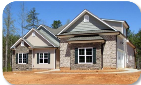
Lot 120 Topside Ct