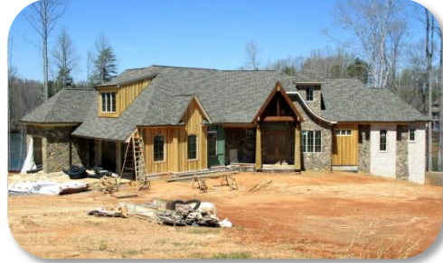
Lot 12 Yardarm Ct