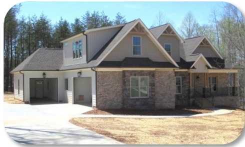
Lot 103 Topside Ct