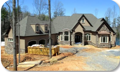
Lot 11 Yardarm Ct

There are currently six houses under various stages of construction in our development. Photos (taken on April 10, 2014) are shown below.